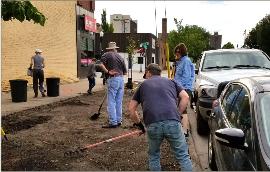
LPF Site 7 - 8th Street Micro-Prairie