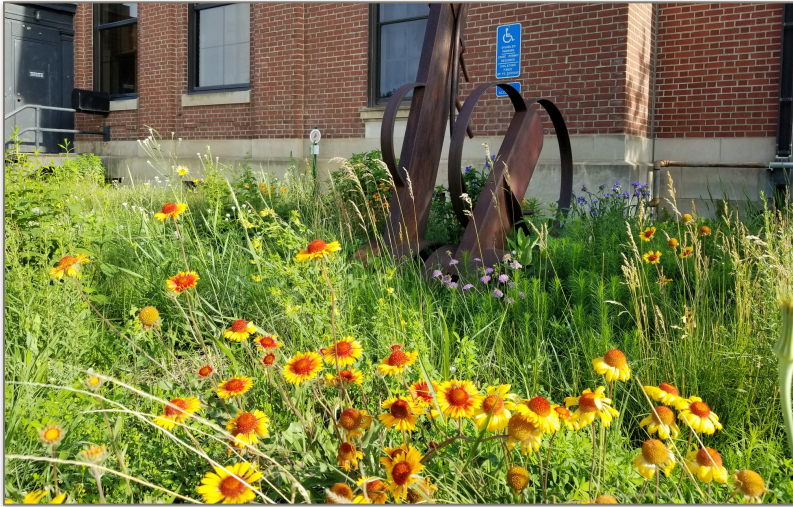
LPF Site 3 - Rourke Micro-Prairie; Photo: P. Schultz