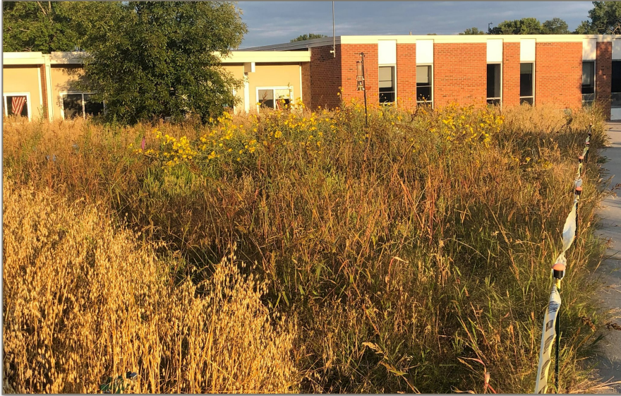
LPA Pollinator Gardens