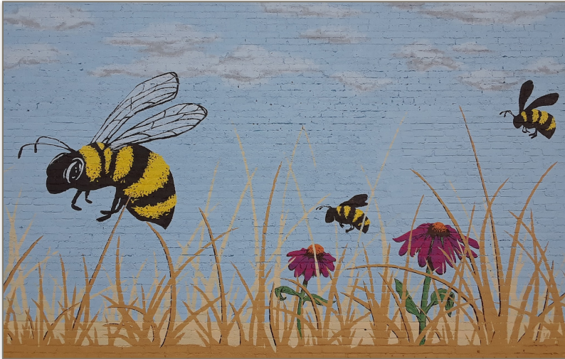
LPF Site 7 - 8th Street Micro-Prairie